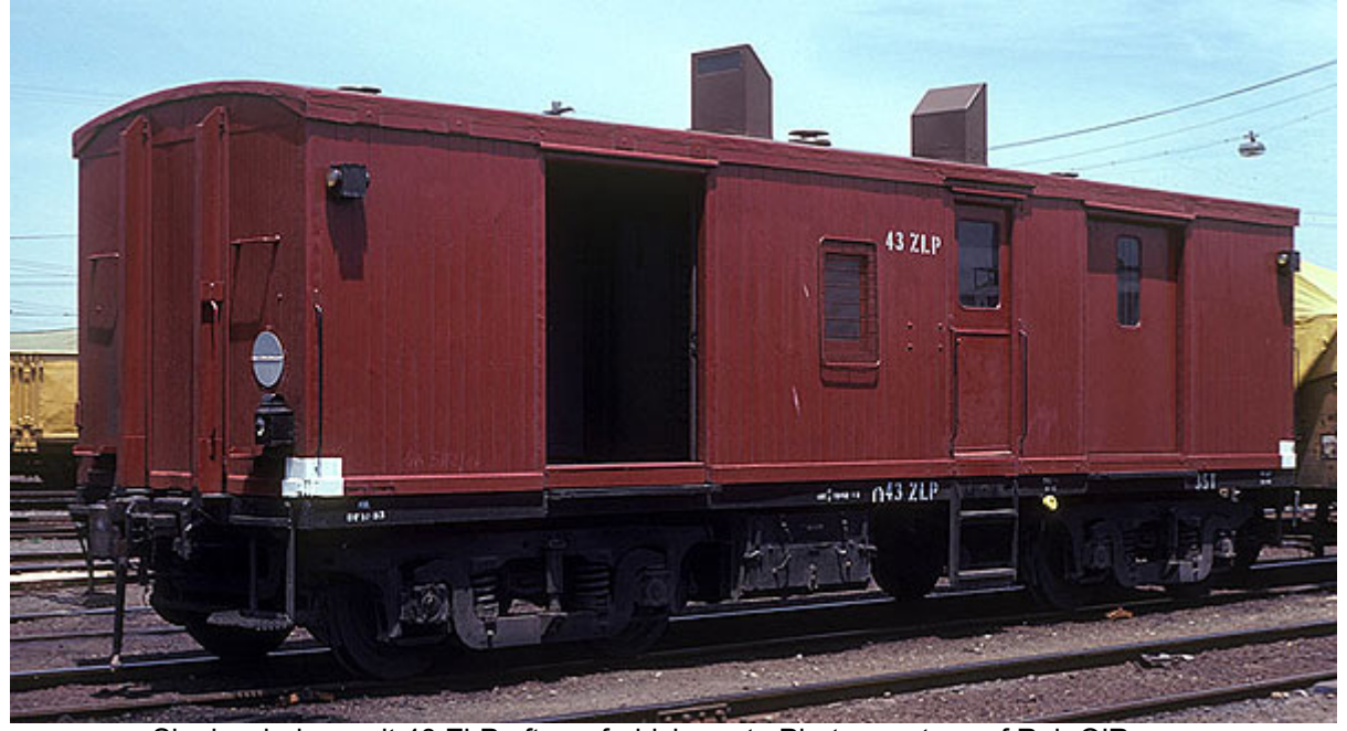
Single window unit 43 ZLP after refurbishment.