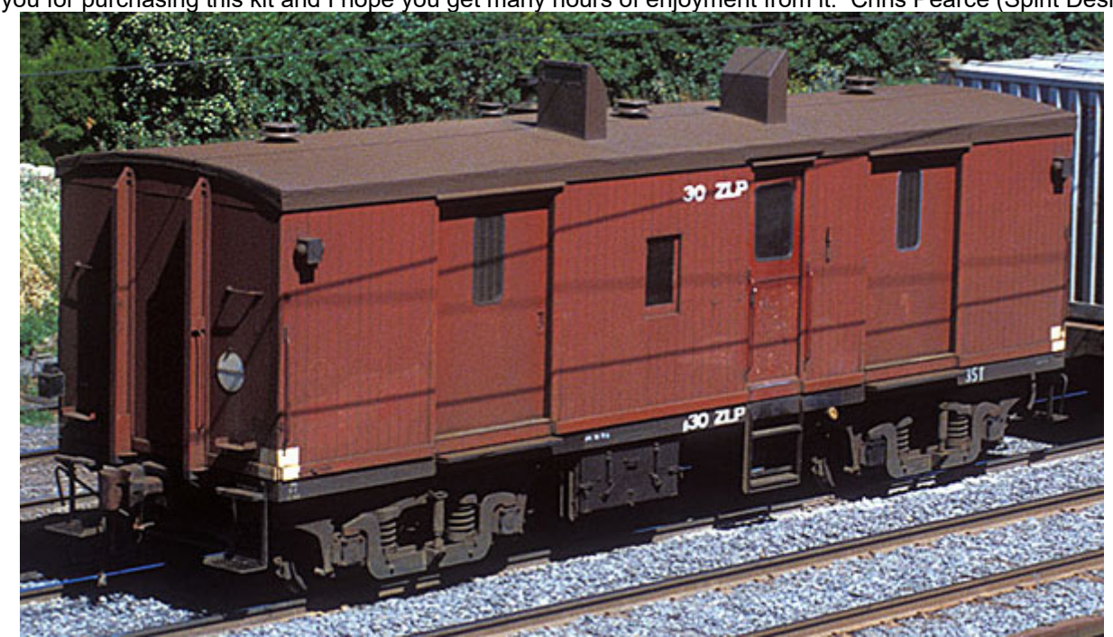
Photo 1 ZLP 30 note the white-painted brake indicator squares.

Requires Micro-Trains 1144 BX bogie to complete. Available separately from Spirit Design. Thank you for purchasing this kit and I hope you get many hours of enjoyment from it. Chris Pearce (Spirit Design)