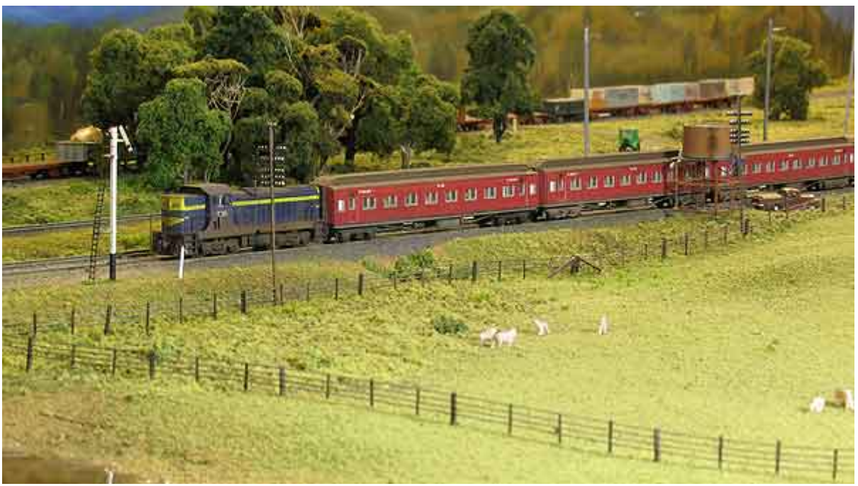
Why not get some detailed passenger cars like the 'AE' cars featured above?