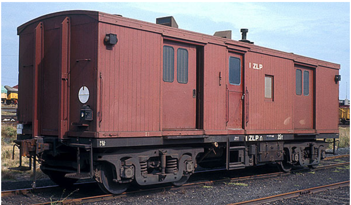
2-window door version.

Super detailing: There are 4 small rectangular markings near the edges of the sidewalls. Small pieces of styrene can be made and attached to act as lights. Shunter steps can be affixed to the ends of the van as in the photos if so desired as well as handrails in the holes provided.