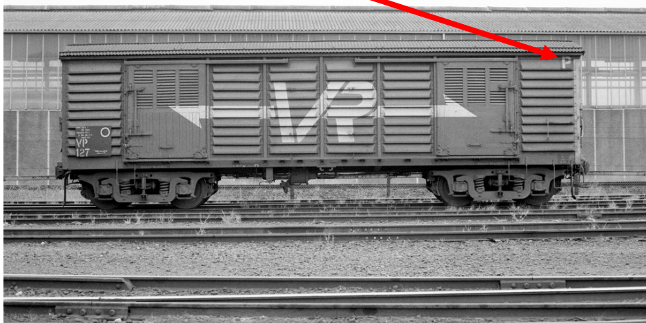
VP127.