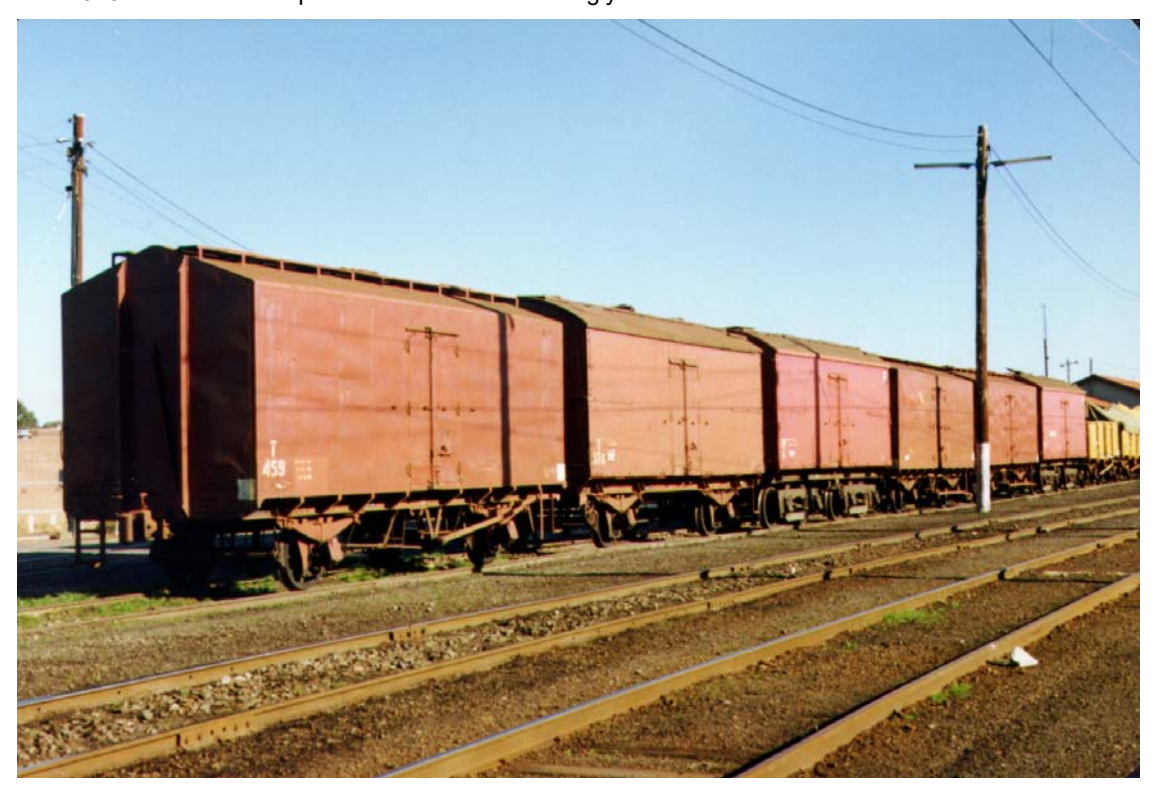
Steel and wooden T vans