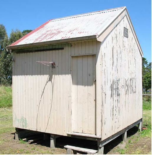
Left: Typical VR 20ft portable still being used by Puffing Billy. Right: After many years of faithful service on the VR, a 12ft portable has been bought by a local farmer and is being used as a small sleep out.

<u>Basic history notes:</u> These kits are based on plans of the original VR portable that has its origins from 1919 and various updates in 1947 and 1972. They were a prefabricated kit that was deposited on-site and assembled with the minimum of fuss. They were based on the successful VR 20ft Portable station and are the same units minus a few features. The portables both the 20ft and 12ft were used for temporary accommodation statewide to meet housing and crew accommodation shortages and sometimes became permanent fixtures at stations, yards and within the grounds of VR Department Residences. They could be found sitting on timber skids or with stumps depending on the climate and White Ant infestations in the area. Surviving examples around the countryside have outlived their bigger and more expensive brothers whilst others have found homes as sheds on farms.