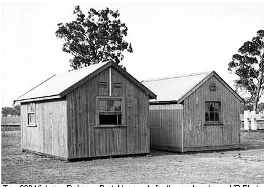
Two 20ft Victorian Railways Portables ready for the rural workers.

**Matches the paint sample taken from the building many years ago