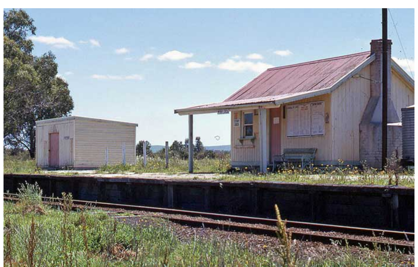
Stony Creek's 20ft VR portable shows a 1960s paint scheme and the usual Railway timetables hanging on the wall outside.

**Matches the paint sample taken from the building many years ago