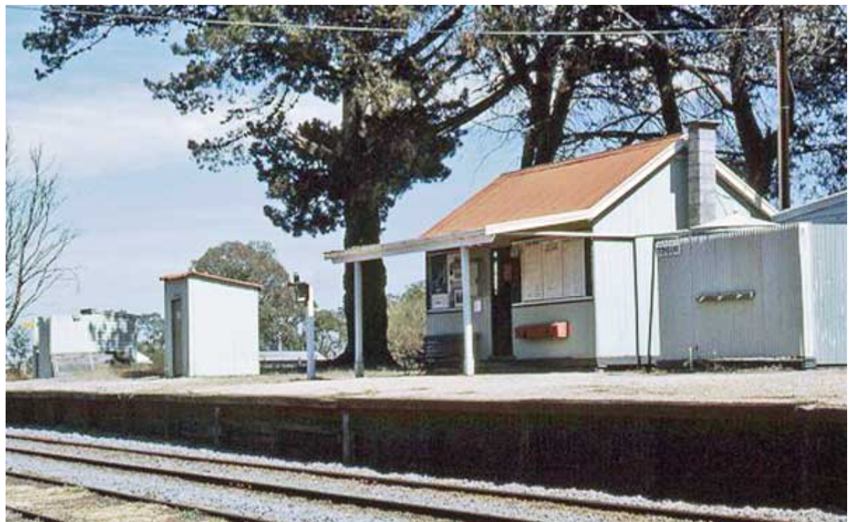
Another example, this time at Fernbank featuring the post-1960 style pale green scheme and the 2-legged canopy version. Note the staff boxes on the wall and various poster boards.