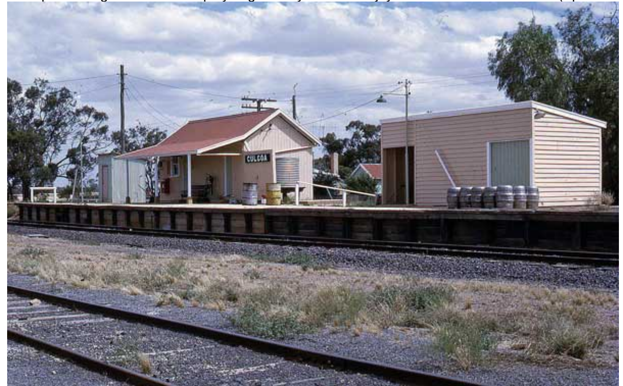
Typical VR 20ft portable station at Culgoa. It appears to be painted in the Mocha style. Note the extra detail around the portable and that the platform is both cement and wooden varieties.

Thank you for purchasing this kit and I hope you get many hours of enjoyment from it. Chris Pearce (Spirit Design)