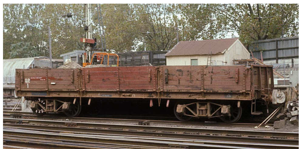
QR1