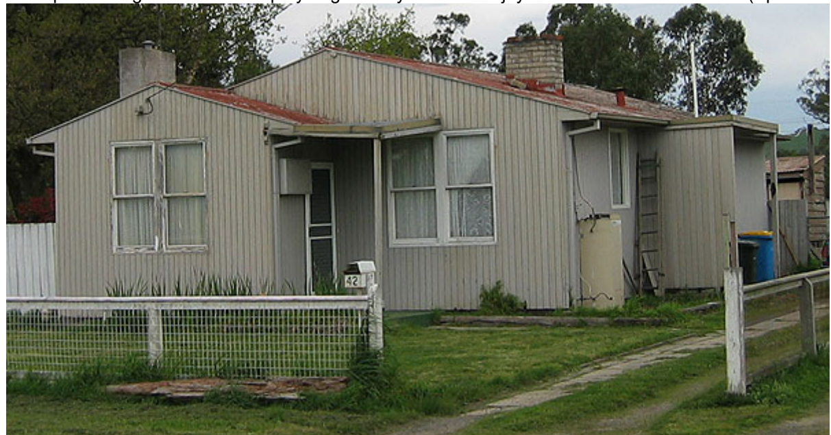
One of the variations of a typical Victorian Railways 4 BR DR. 05/03/2006