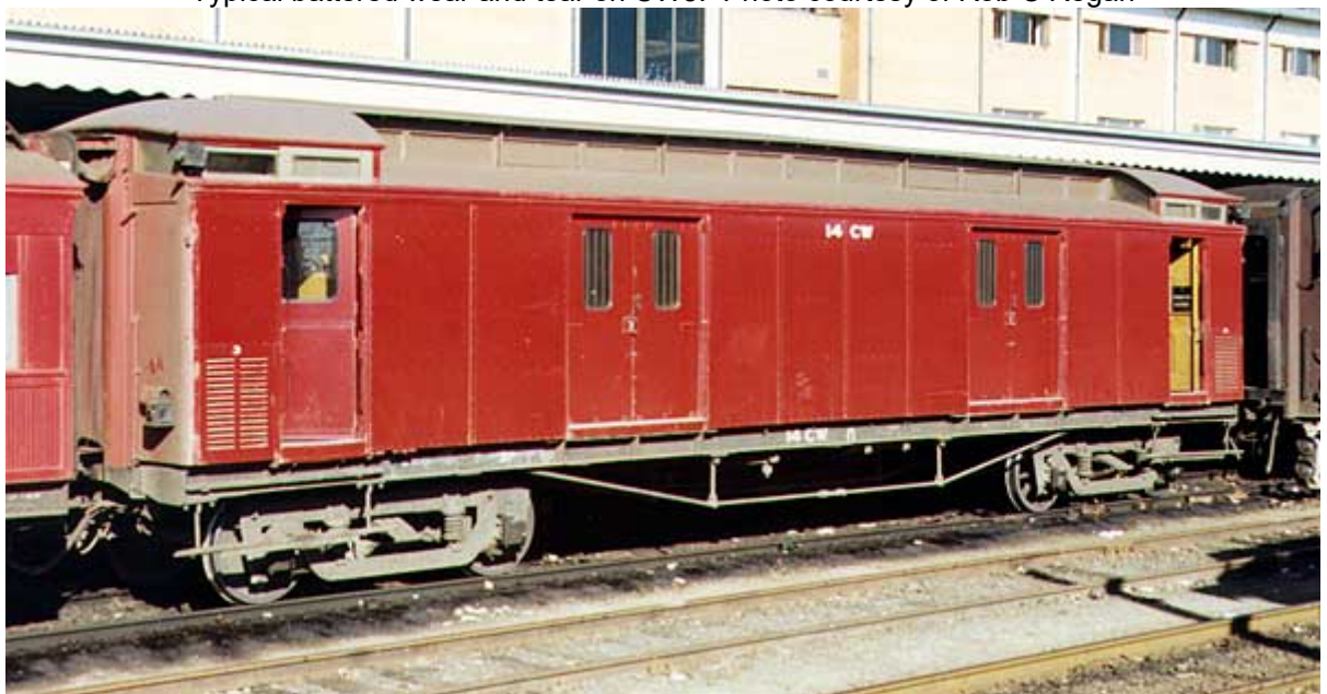
The bright red colour scheme on CW14 early 1980s.

Decals: Using the prototype photos above and the photo of the finished model, position the decals accordingly.