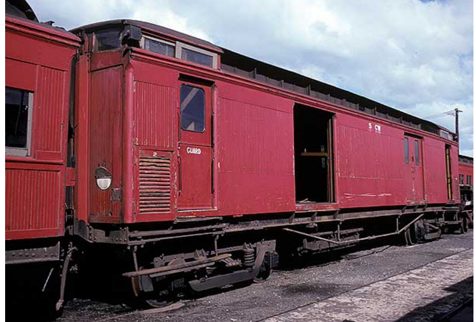
Typical battered wear and tear on CW5.