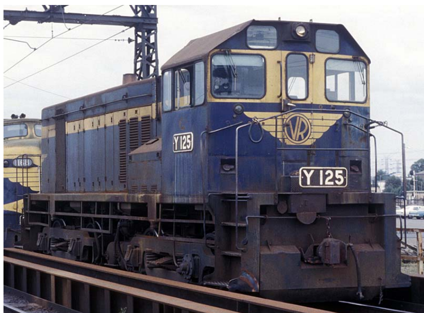
Battery box fitted to the RHS behind the cab. 3D print provided. File the 'Z' gauge on the body flat so that the 3D can sit flush

Glue the chassis to the body using PVA so that a little water can be used later if you decide to power the unit in the future