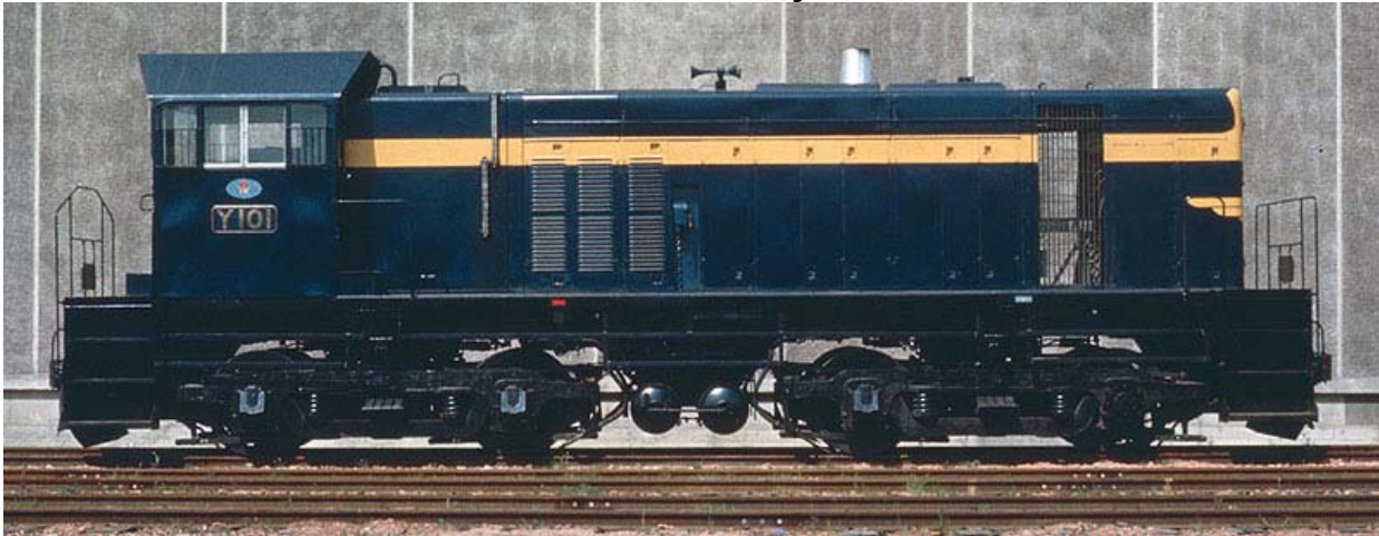
Brand new Y101 arrives from Clyde and is seen outside Dynon.

Basic history: The Y class was the second-largest diesel class of the Victorian Railways with 75 members being built by Clyde's Granville workshops in 3 batches between 1963-1968. Utilising bogies off scrapped swing door electric trains and featuring a 6-cylinder EMD 567 and later a 645 engine they were highly regarded by crews and were a versatile go-anywhere engine. The long hood is designated the no1 end and controls were arranged accordingly. The fleet was seen over the entire VR system with 4 always on the standard gauge. Later on, in life, they received the V/line orange and grey livery and this was later replaced on the remaining active units with the new V/line red and blue. Some were fitted with DOO window openings altering their appearance. A few have entered private tourist railways and are still giving reliable service.